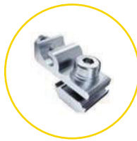
Grounding Lug Kit (Optional)