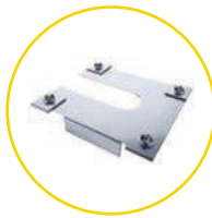
Grounding Clip (Optional)