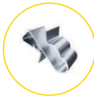
Cable Clip (Optional)