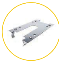
Grounding Clip (Optional)