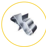
Cable Clip (Optional)